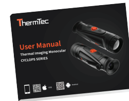
User manual (x1)