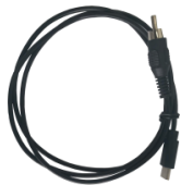
Video output cable (x1)