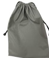
Carry bag (x1)