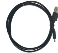
USB cable (x1)