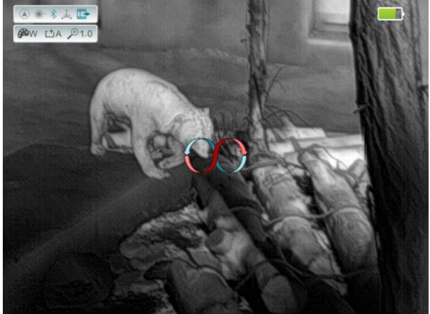
Figure 5-6. Reticle calibration interface