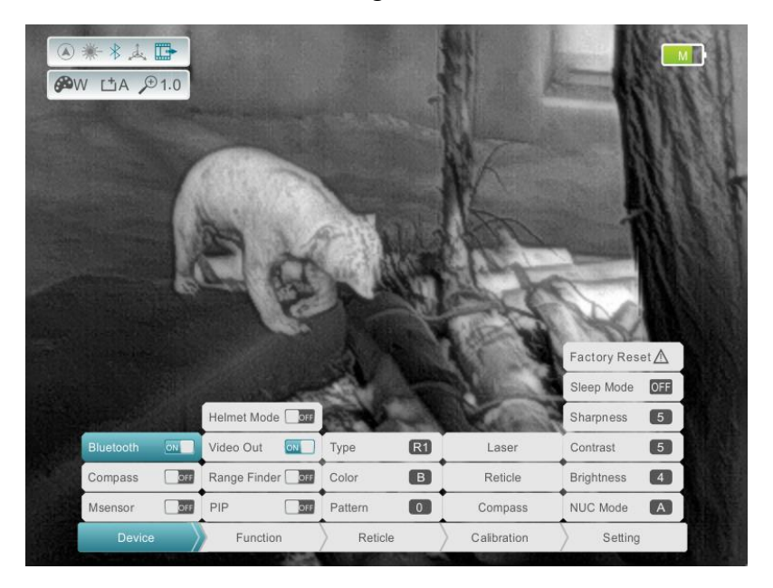
Figure 5-3. Advanced menu

out when select a certain function, as shown in figure 5-3.