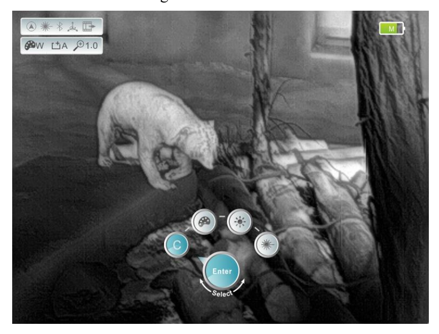
Figure 5-2. Context menu