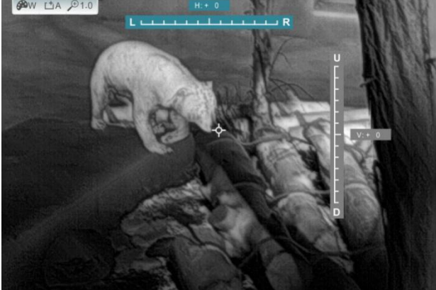
Figure 5-4. Rangefinder interface