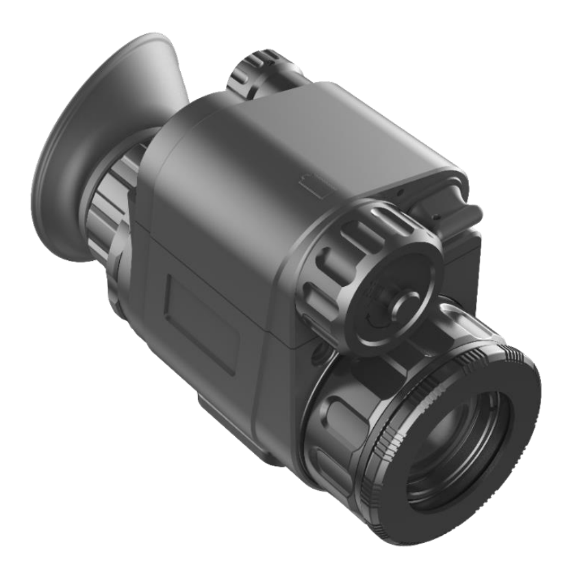
Figure 1-1. Xmini multifunction thermal image

Xmini is a multifunction thermal imager with built-in VOx uncooled infrared focal plane array detector. Xmini has small size, light weight, high performance, various purpose and many other strengths. Moreover, a variety of sensors are equipped and it not only can be used as Monocular hand-held thermal imager or portable infrared thermal image sight but also can be used as wearable device when installed on the helmet. Xmini can be widely used in investigation, security, search and rescue, outdoor sports and other application fields.