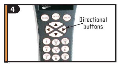
Use the hand control direction arrow buttons to point telescope at a distant land object, like a telephone pole or at night you can use the moon. Center and focus the object in the 25mm eyepiece of the telescope.