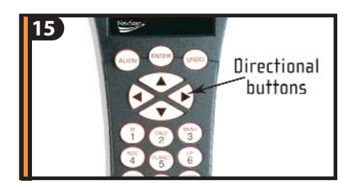
Use the directional arrow keys on the hand control to slew (move) the telescope towards any bright celestial object in the sky. Center the object in the finderscope and press ENTER.