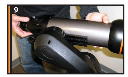
Slide the optical tube dovetail into the fork arm as shown above.