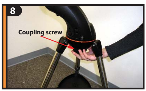
Thread the coupling screw into the hole at the bottom of the fork arm base. Tighten screw to secure the fork arm.