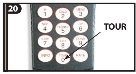
Now that your telescope is properly aligned, you are ready to find your first object. Press the TOUR button on the hand control. The hand control will display a list of objects that are visible for the date and location entered.