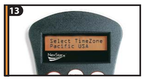
Now, using the Up and Down scroll buttons (located on #6 and #9), verify the time zone you are in and press ENTER.