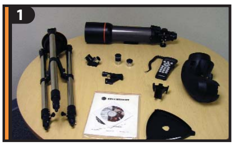
Your NexStar 102SLT includes: optical tube; fork arm; pre-assembled tripod; computerized hand control; hand control holder; star diagonal; two eyepieces; finderscope; accessory tray; documentation including an owner's manual, The Sky® CD and NSOL Telescope Control Software.