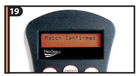
Repeat the process for the third alignment star. When the telescope has been aligned to the final star, the display will read "Match Confirmed". Press UNDO to display the names of the three bright objects you aligned to, or press ENTER to accept these three objects for alignment.