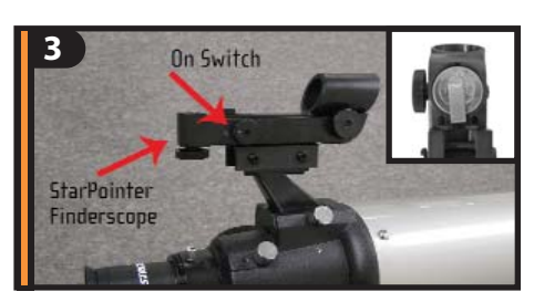
Now you will need to align the finderscope. Turn on the red LED light by turning the knob shown above. When used for the first time, remove the clear plastic disk that is located between the battery clip and the battery. See inset.