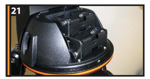
Place AA batteries inside the battery compartment located at the base of the fork arm.

Before you can begin observing, you must setup your hand control, align your finderscope and align your telescope. Step by step instructions are included in the following Hand Control Setup section.