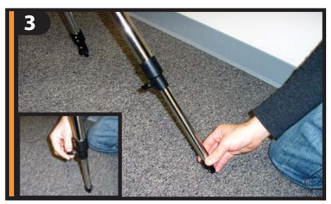
Extend tripod legs 6 to 8 inches by loosening the tripod leg locking knob and pulling the leg to desired length and re-tightening knob.