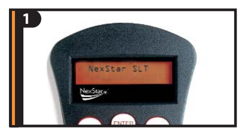
Turn power switch (located on the side of the fork arm) to "on" position. The light will come on and the hand control will display "NexStar SLT".

Before you can begin using your NexStar 102SLT, you must setup your computerized hand control and go through the SkyAlign alignment procedure. In order for the NexStar to accurately point to the objects in the sky, it must first be aligned with known positions (stars) in the sky. With this information, the telescope can create a model of the sky, which it uses to locate any object in its database