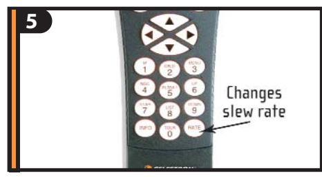
In order to accurately center an object in the eyepiece it may be necessary to change the slew speed of the motors. To change the slew speed, press the RATE button then select a number from 1 (slowest) to 9 (fastest).