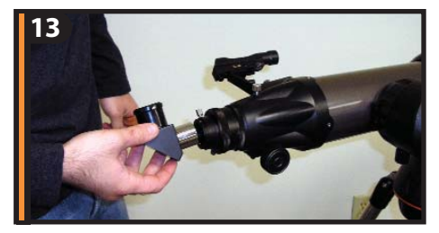
Insert the chrome barrel of the star diagonal into the focuser and tighten the two silver screws to secure in place.