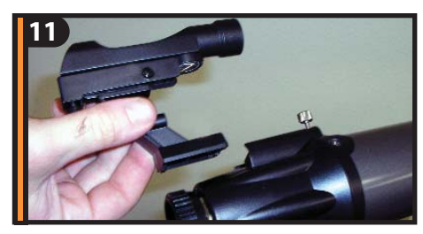
To attach the finderscope, loosen the silver screw and slide finderscope into mounting platform.