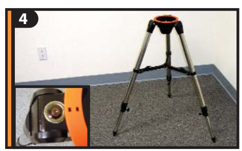
All three legs should be the same length to provide a level platform for the telescope. A bubble level is included (inset) to assist in leveling.