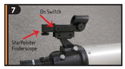
Once you have aligned your finderscope, make sure to turn off the LED light to conserve the battery. Now you are ready to align the telescope. This will have to be done at night.