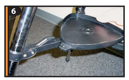
Once grooves are aligned, turn accessory tray until it snaps into clips on each leg brace.