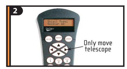
You will notice that there are directional arrows in the center of the hand control. These only move the telescope. They cannot be used to scroll through menu features.