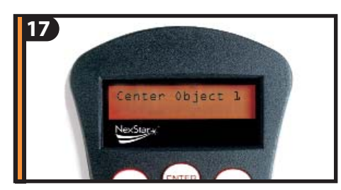
The hand control will prompt you to center the bright alignment star in the center of the eyepiece. Once centered, press ALIGN. This will accept the star as your first alignment position.