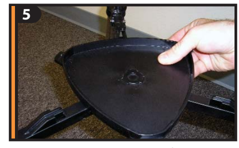
Place accessory tray on top of center leg brace by lining up the grooves on the tray to the post on the brace.