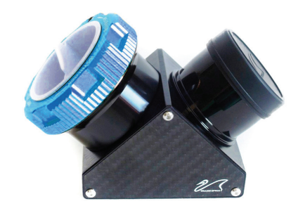
2" Rotolock Durabright Diaelectric Diagonal