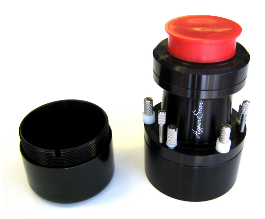
Secondary holder (ships attached to lens), & HyperStar lens