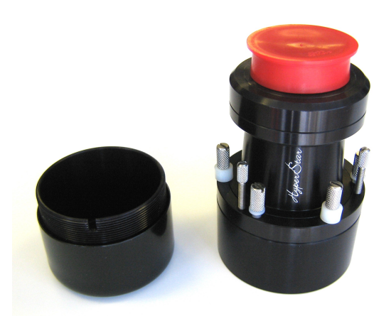
Holder capping the HyperStar