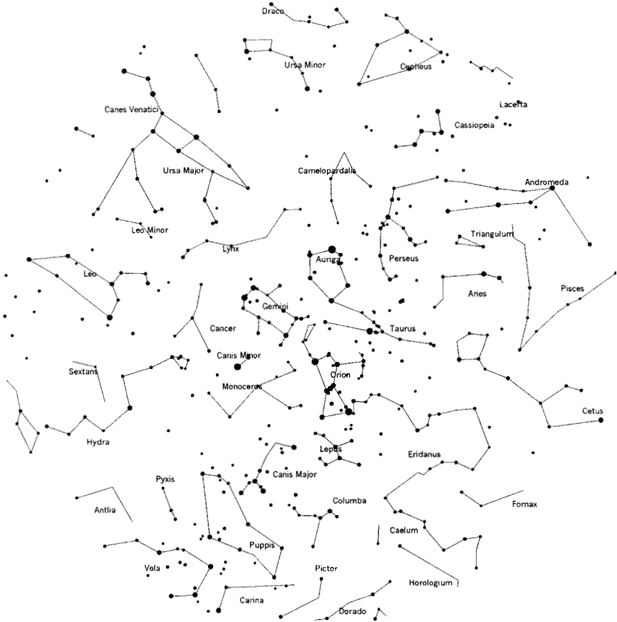
Figure 1.2. Northern winter evening sky as seen from a suburban location. Stars shown to magnitude 4.5.

These star charts were created by the author using Epoch 2000 Sky Software, and are included by kind permission of Meade Instruments Corporation.