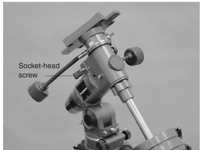
Figure 3: Remove the socket-head screw indicated on the mount.