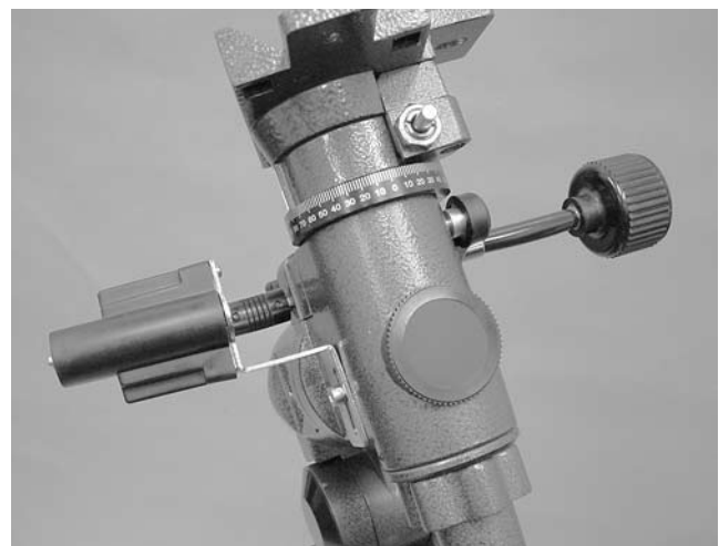
Figure 4: The R.A. motor drive assembly properly connected to the mount.