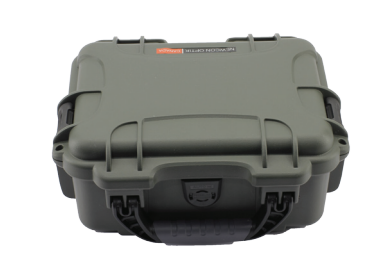
Optional Hard Case