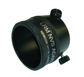
Optional NVS Connector